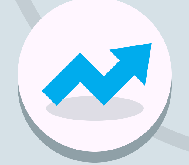
What's trending on social media?