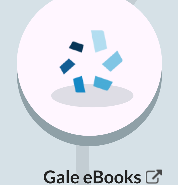
Browse topics in a library database or encyclopedia.