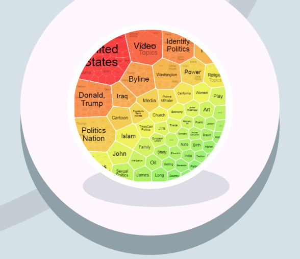
General OneFile Topic Finder